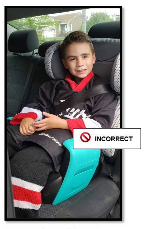
As seen above, wearing padding in a vehicle, will significantly affect seatbelt fit. Shoulder strap is incorrectly sitting too low on the childs arm, and the belt is fitted to hockey gear rather than the childs body.

Hockey parents can all agree, rushing to the rink on time, navigating the chaos of the change room and getting their player suited up, is hectic on a good day. With social distancing regulations in place it's tempting to suit up your player before arriving at the rink- while hockey gear is designed to keep kids safe on the ice, it can potentially put them at risk in the vehicle. Shoulder and chest pads, padded pants and other hockey gear will impact the harness or seatbelt fit, significantly reducing its effectiveness.